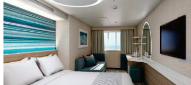
Suite: $2,290 per person