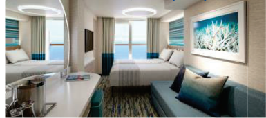
Balcony: $1,145 per person