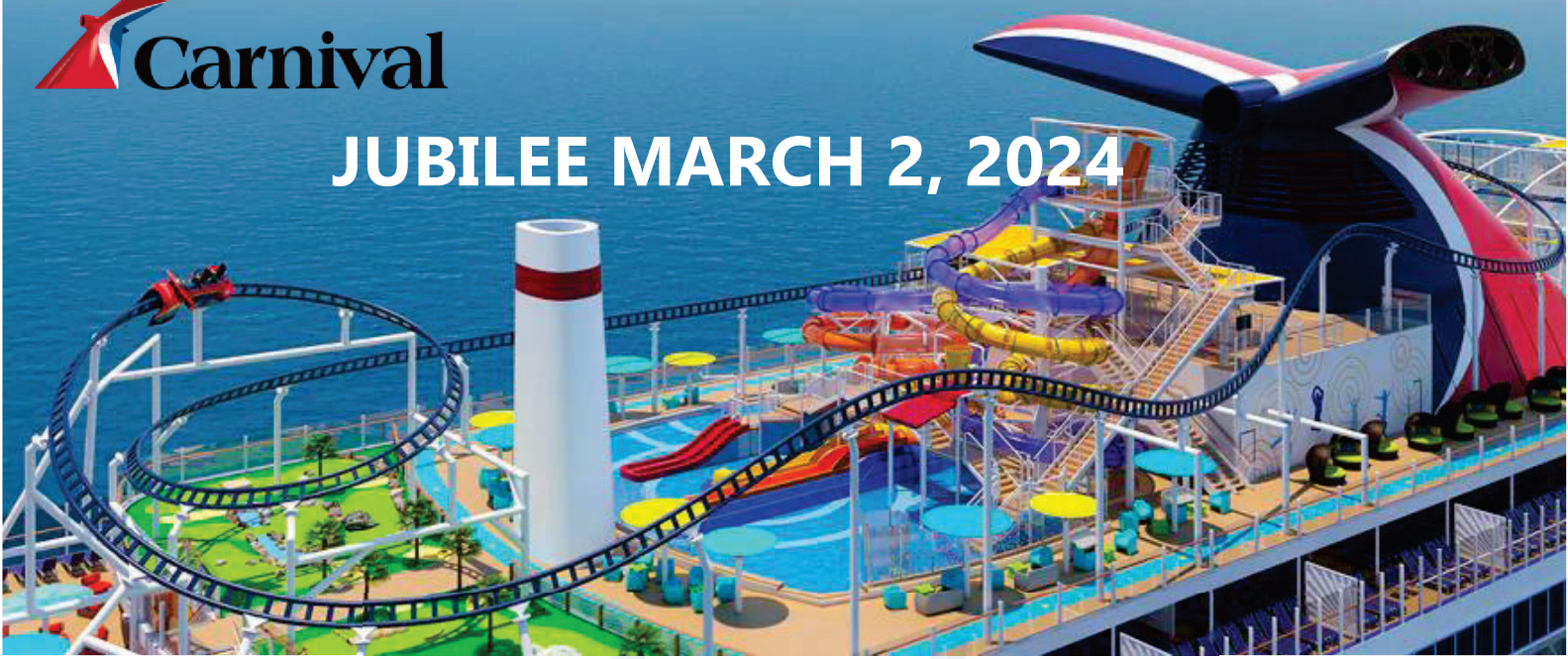
Interior: $845 per person